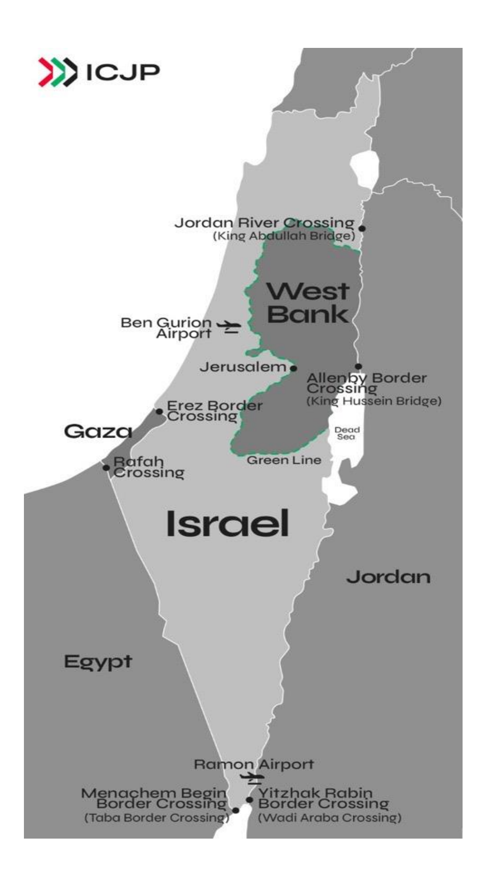
Map 1: This map outlines all the main entry points into the occupied Palestinian territory and Israel. The point of entry relevant to this report is King Hussein Bridge known as Allenby Border Crossing.